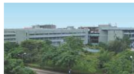
Engineering and Technology