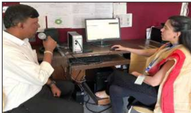
Voice Assessment using MDVP