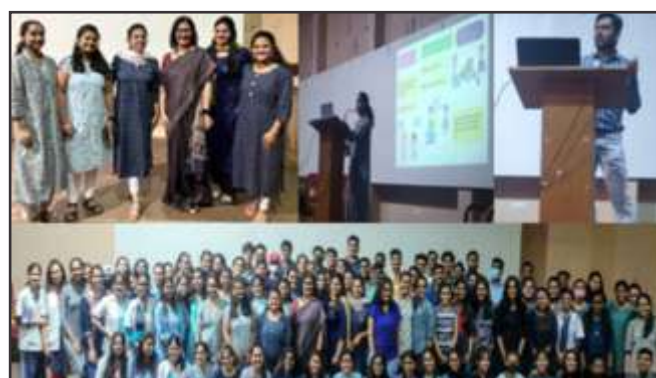
Workshop for students on Autism Spectrum Disorder