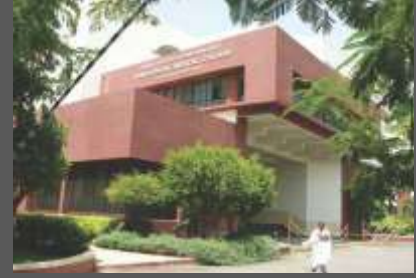
HOMOEOPATHIC MEDICAL COLLEGE, PUNE