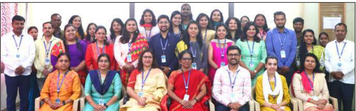
Our capable enthusiastic team: Teaching and Non-teaching staff at SASLP

Speech and Language Pathology deals with the normal and abnormal aspects of voice, speech, language and swallowing. Students of Speech Language Pathology are trained in diagnosis, differential diagnosis and management of speech and language disorders, which includes voice disorders, speech sound disorder, stuttering, speech and language problems associated with hearing impairment, intellectual disability, cerebral palsy, cleft palate, autism spectrum disorders, oral and laryngeal cancers, stroke/ paralysis, and learning disorders.