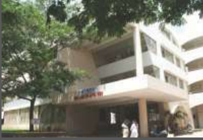
COLLEGE OF AYURVED, PUNE