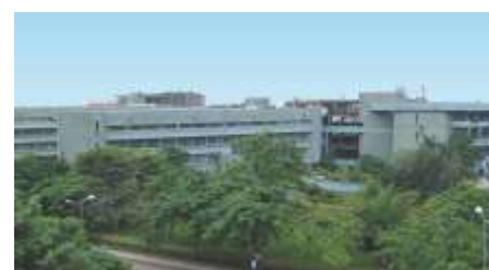
Engineering and Technology