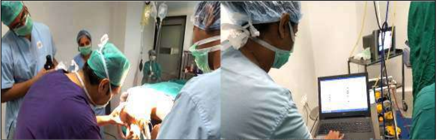
Intraoperative Monitoring using Auditory Brainstem Response