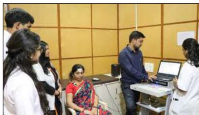
Clinical Teaching in Audiology