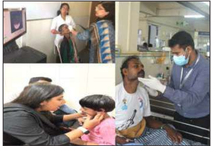
Assessment & Management of Feeding and Swallowing Disorders