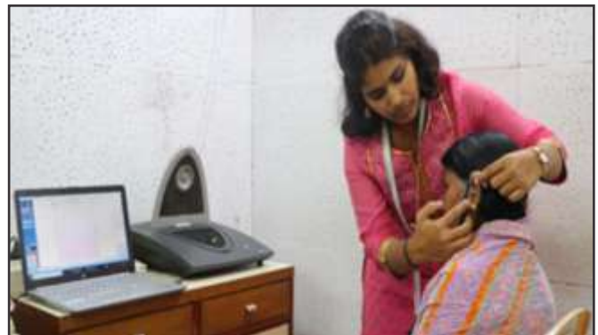
Measurement Instead of Measurement