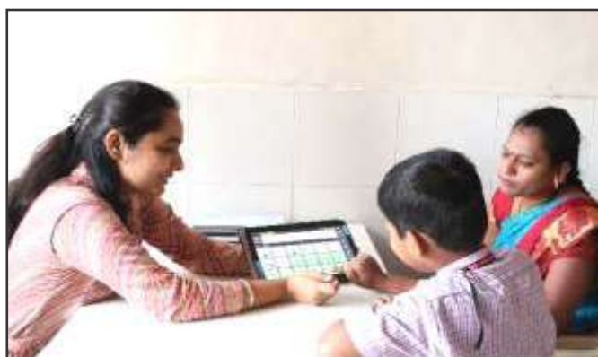
Use of Augmentative and Alternative (AAC) device for paediatric speech and language therapy