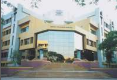
DENTAL COLLEGE & HOSPITAL, PUNE