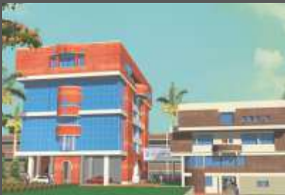
POONA COLLEGE OF PHARMACY, PUNE