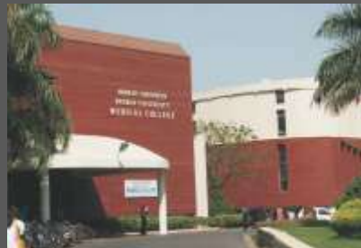
MEDICAL COLLEGE, PUNE