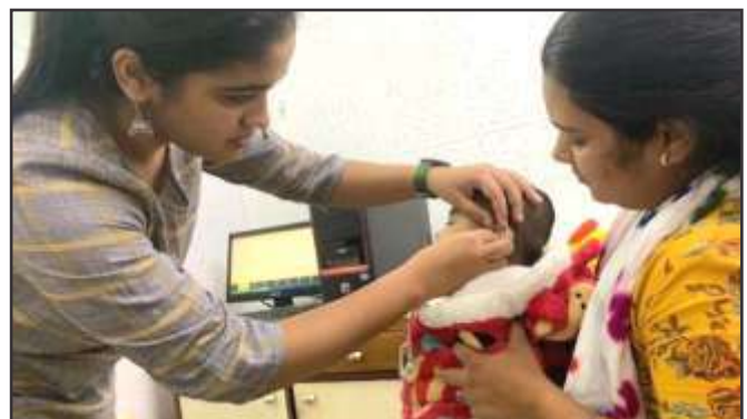
Paediatric Hearing Aid Trial