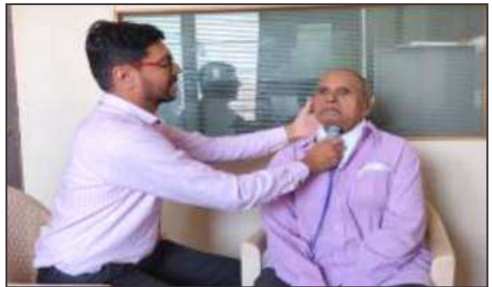
Voice Therapy using Artificial Larynx