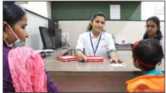
Paediatric Speech and Language Assessment

Management of individuals with speech, language and swallowing disorders.