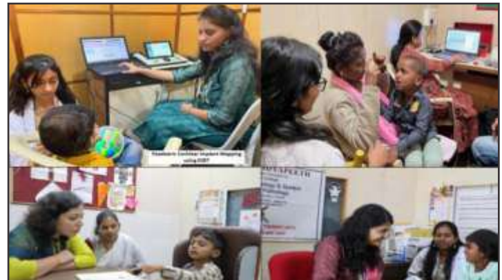
Cochlear Implant Unit