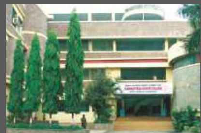
YASHWANTRAO MOHITE COLLEGE, PUNE