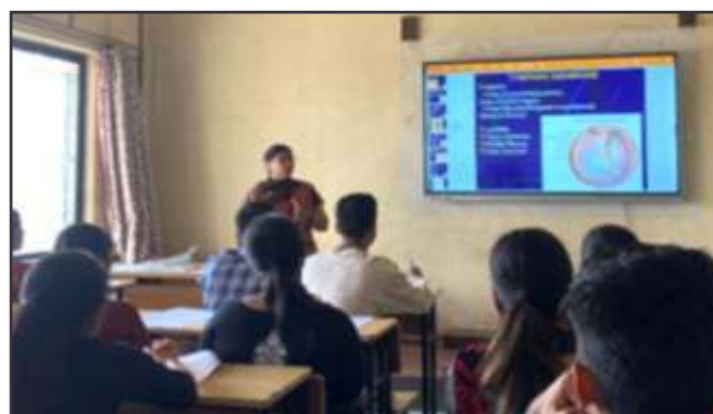
ICT enable classroom teaching