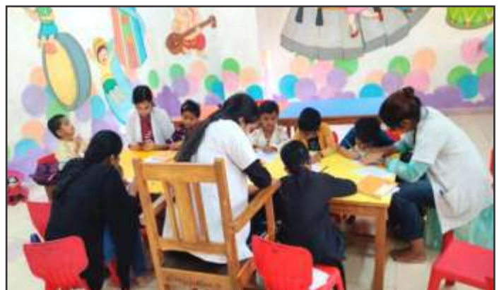
Literacy Intervention to achieve school readiness skills