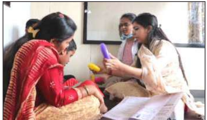
Paediatric Language Assessment at Holistic Outcome Based Planned Early Evaluation and Intervention (HOPE) Clinic