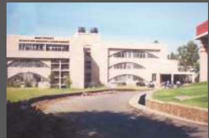
INSTITUTE OF HOTEL MANAGEMENT & CATERING TECHNOLOGY, PUNE