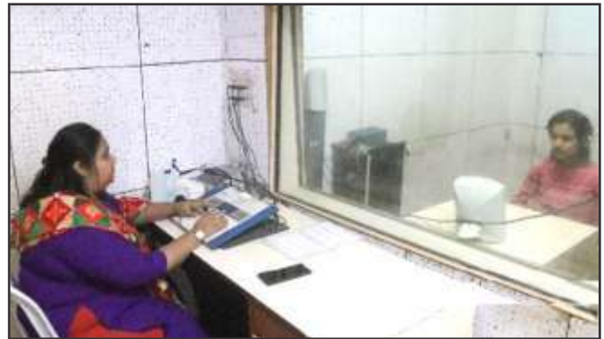
Pure Tone Audiometry