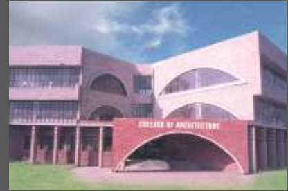
COLLEGE OF ARCHITECTURE, PUNE