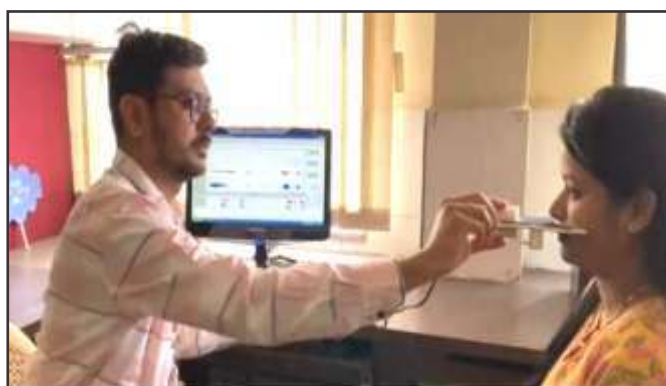
Oral and Nasal Resonance using Nasal View