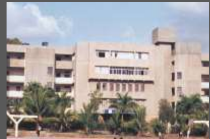
INSTITUTE OF MANAGEMENT AND ENTREPRENEURSHIP DEVELOPMENT, PUNE