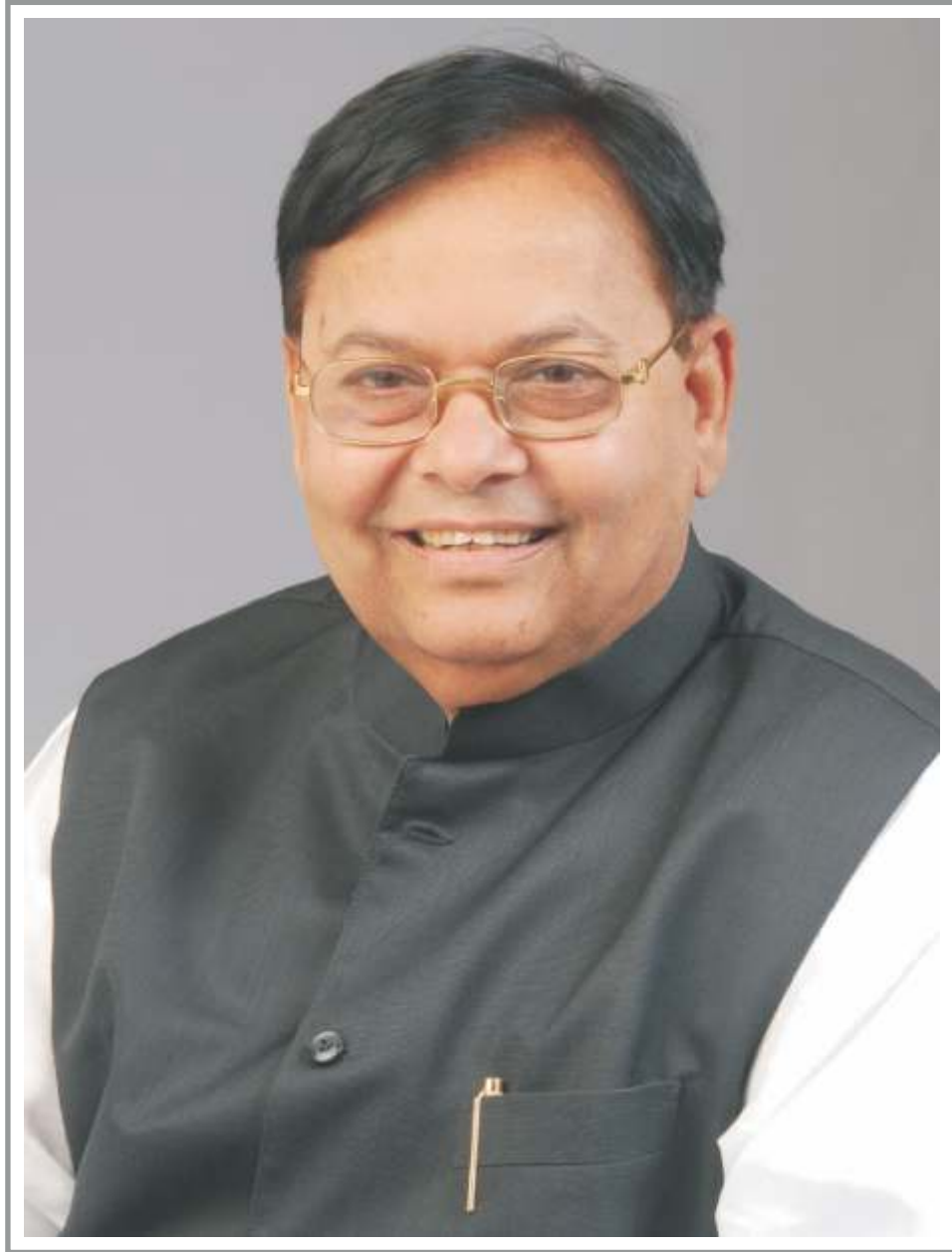
Hon'ble Dr. Patangrao Kadam