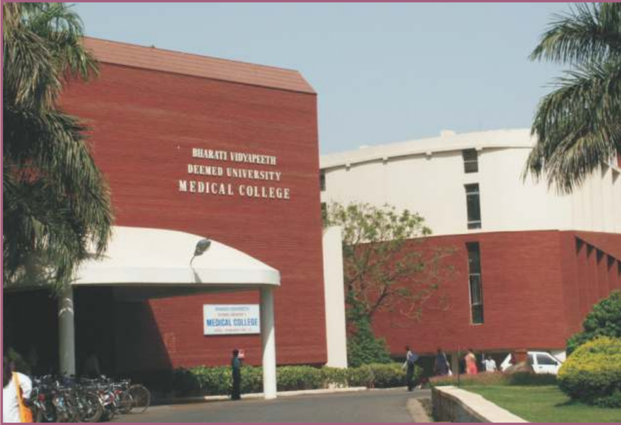
MEDICAL COLLEGE, PUNE