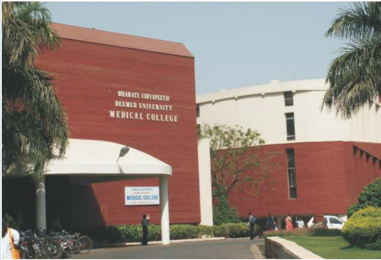
MEDICAL COLLEGE, PUNE