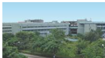
Engineering and Technology