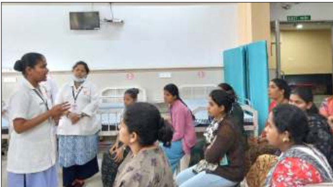
Patient Teaching at Bharati Hospital and Research Centre, Pune