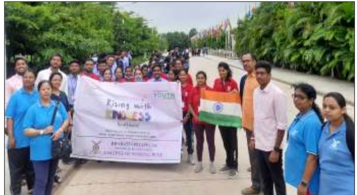
Faculty Members & Students of Bharati Vidyapeeth College of Nursing, Pune representation in Heart fullness Conference at Hyderabad, India