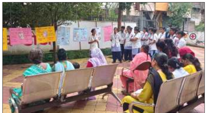
Society Transformation through Community Education