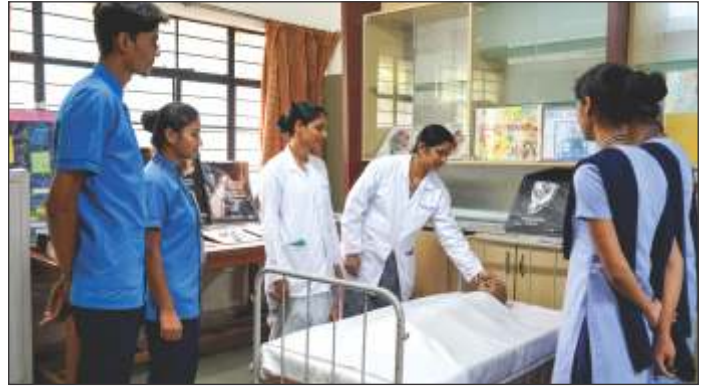
Child Health Nursing Lab