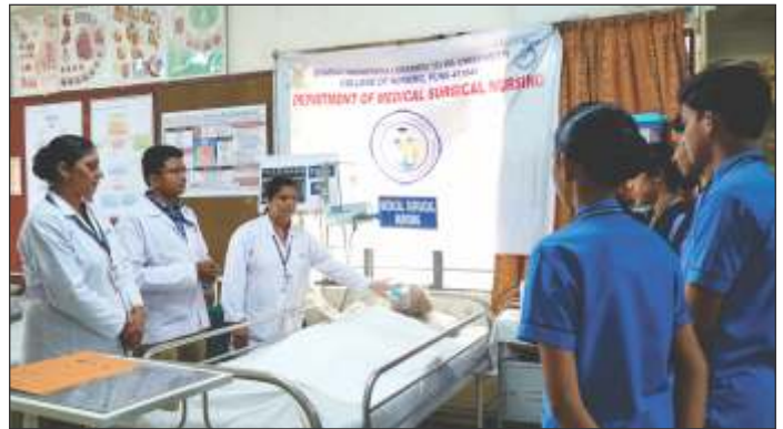
Medical Surgical Nursing Lab