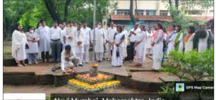
75th Independence day celebration