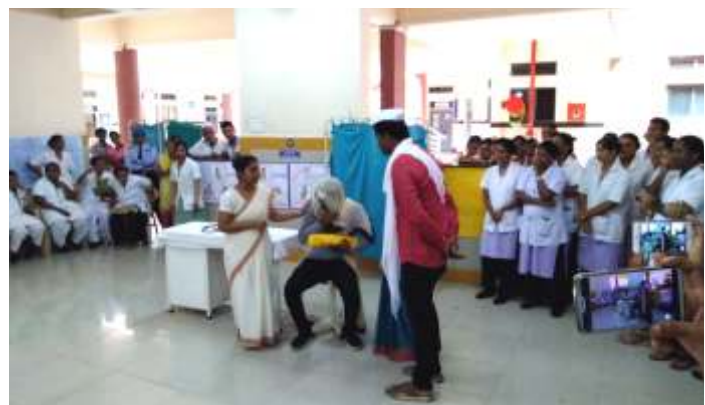
World Breastfeeding Week Celebration