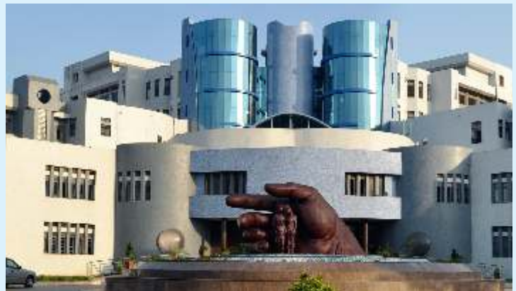
Bharati Hospital, Sangli