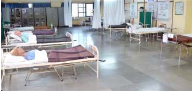
Nursing Foundation Lab