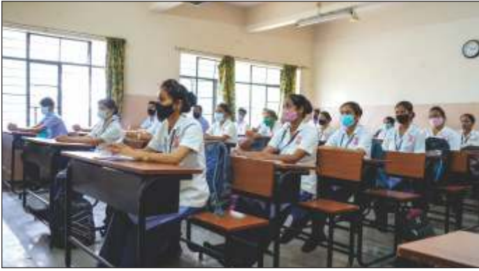
ICT enabled Class Room