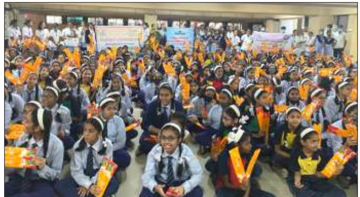
Community Welfare Activity "Distribution of Sanitary Pads to Adolscent Girls"