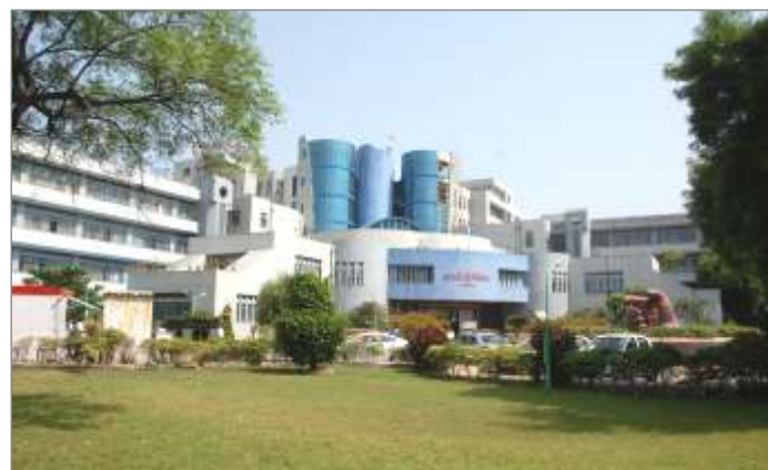
Bharati Hospital, Sangli Campus