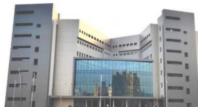
Bharati Vidyapeeth Medicover Hospital, Navi Mumbai

To make the students aware of their social responsibility extension activities conducted are as follows