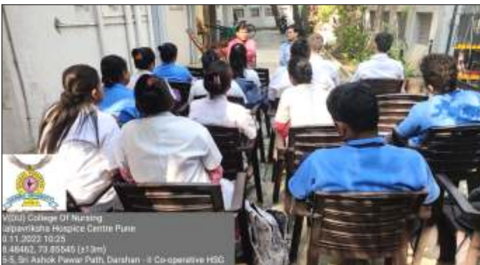
Enhancing Psychomotor Skills