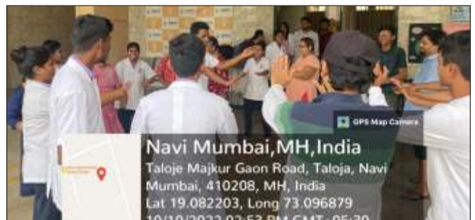
Dance Movement therapy at Jagruti Rehabilitation Centre, Taloja, Navi Mumbai,