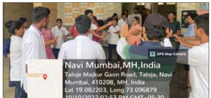
Dance Movement therapy at Jagruti Rehabilitation Centre, Taluja, Navi Mumbai,