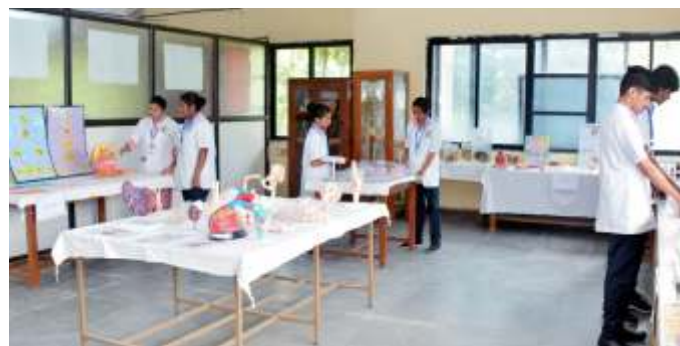
Pre Clinical Lab