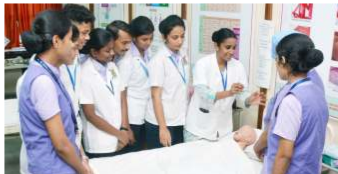
Child Health Nursing Lab