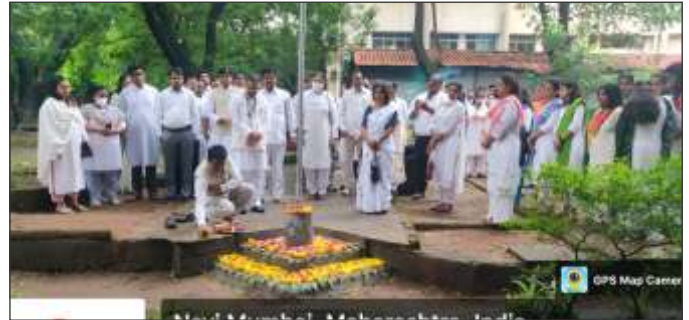
75th Independence day celebration