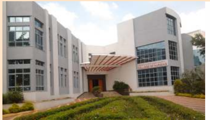
College of Nursing, Sangli