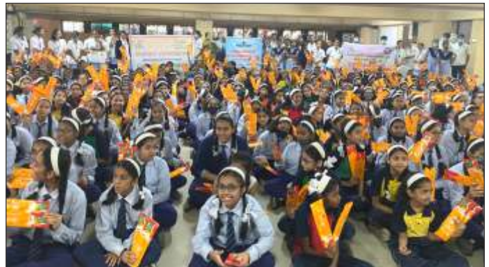
Community Welfare Activity "Distribution of Sanitary Pads to Adolscent Girls"