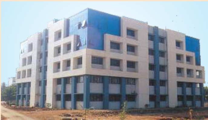
College of Nursing, Navi Mumbai