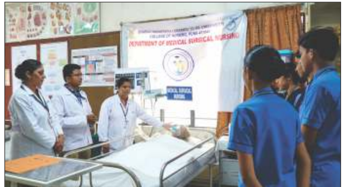
Medical Surgical Nursing Lab