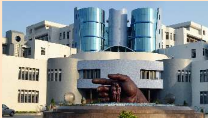
Bharati Hospital, Sangli