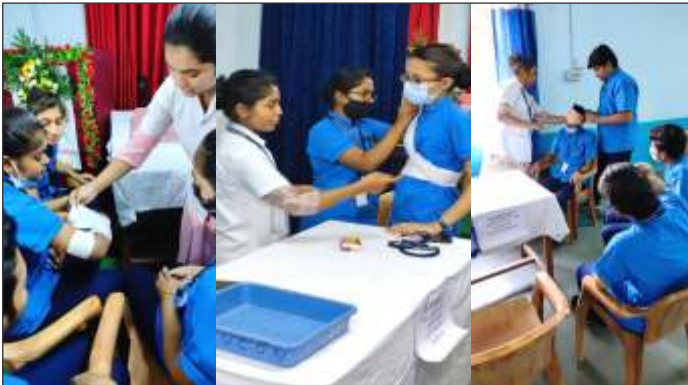
Enhancing Psychomotor Skills