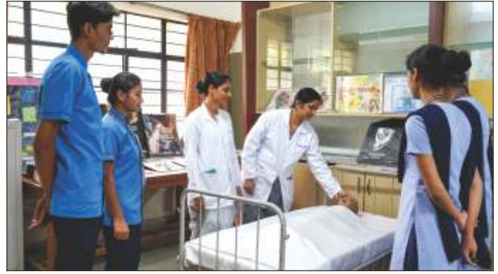
Child Health Nursing Lab