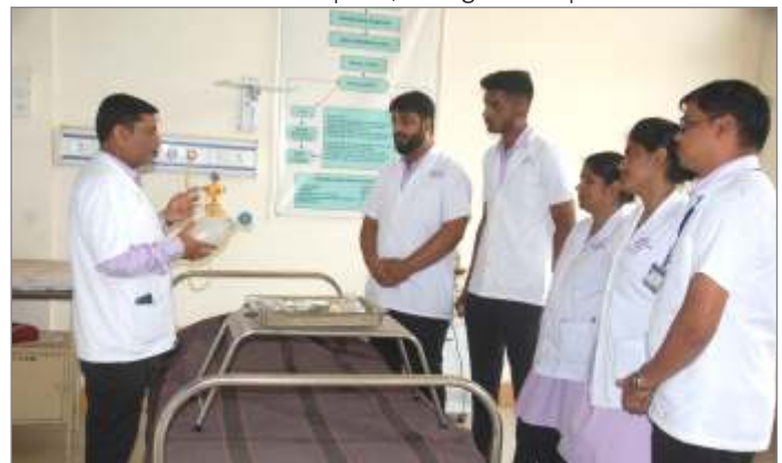
Advance Nursing Lab