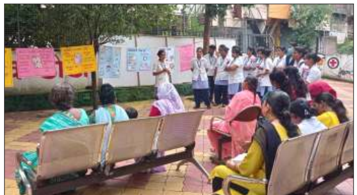
Society Transformation through Community Education