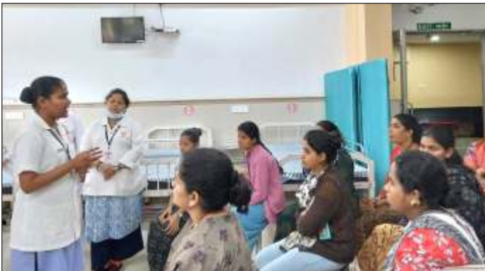
Patient Teaching at Bharati Hospital and Research Centre, Pune