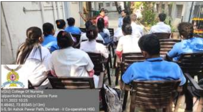
Enhancing Psychomotor Skills