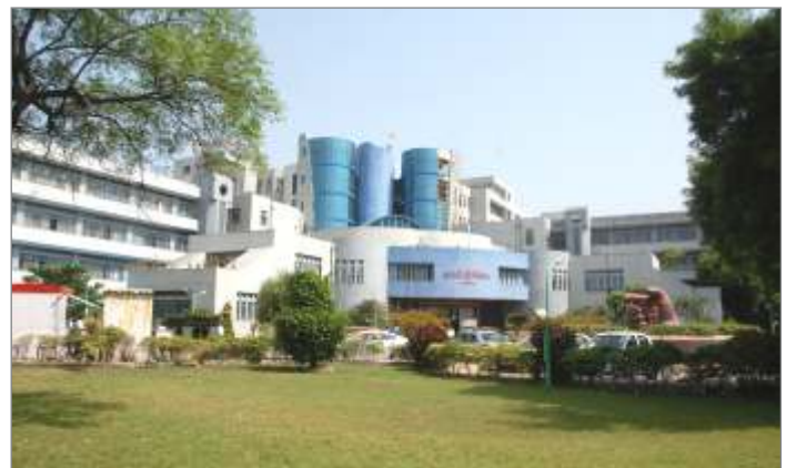
Bharati Hospital, Sangli Campus