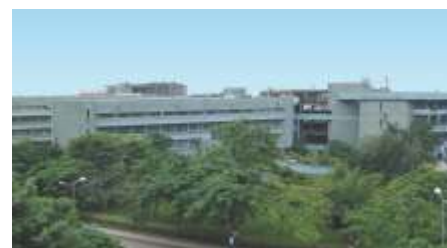
Engineering and Technology