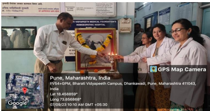
Inauguration by the I/C Principal and Organizing department