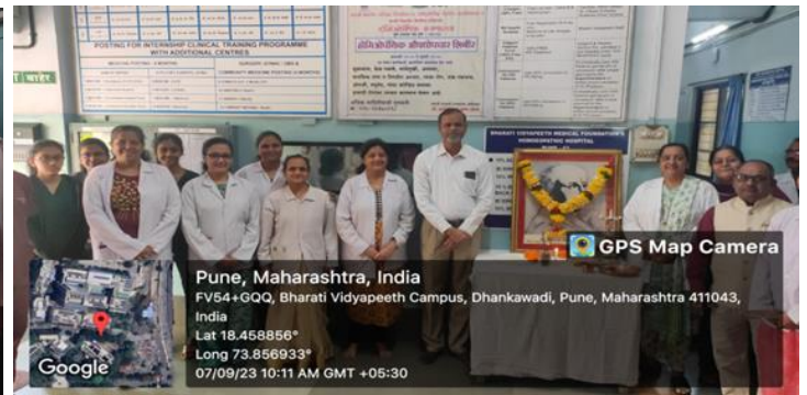
I/C principal along with all faculty during camp inauguration