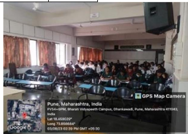
Staff, PG & Interns Attending Clinical session.