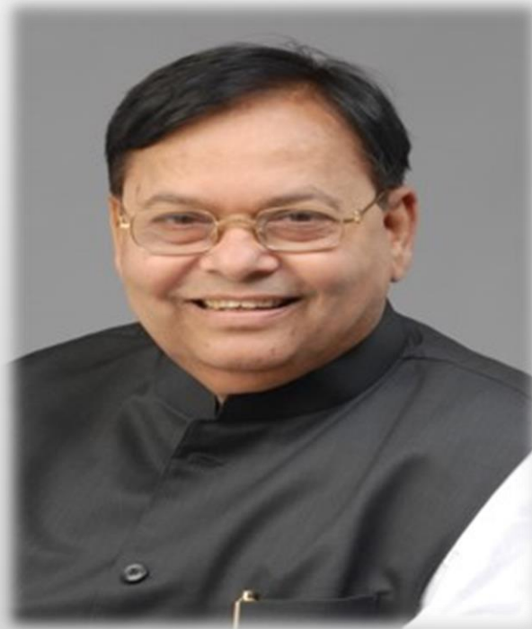
Hon'ble Dr. Patangrao Kadam Saheb

Social Transformation Through Dynamic Education