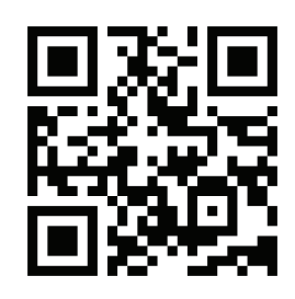
Scan to Pav