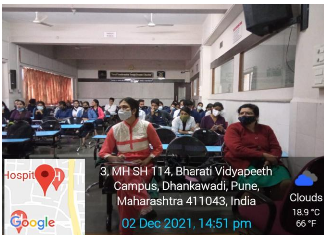
Interns and PG Scholars attending Clinical session