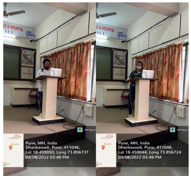
Interns concluding the session