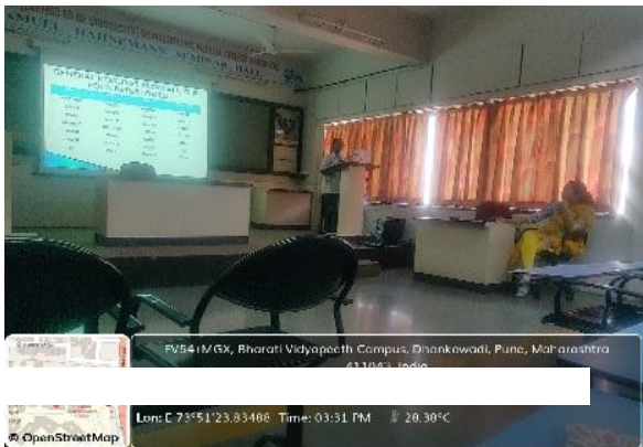
Abhilasha presenting case of A.Rhinitis