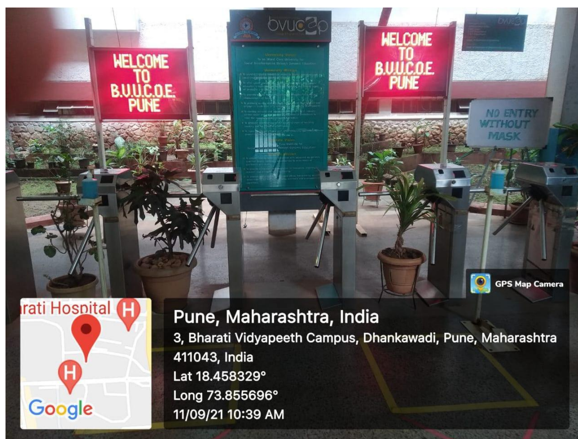
SENSOR BASED ENTRANCE GATE AT ENGINEERING COLLEGE, PUNE